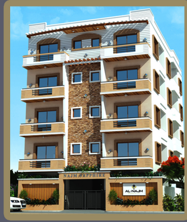
NAJM SAPPHIRE Marappa Garden