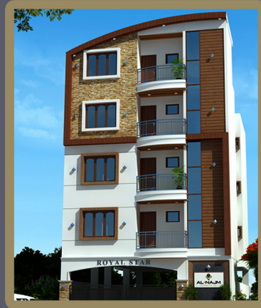
NAJM STAR SK Garden