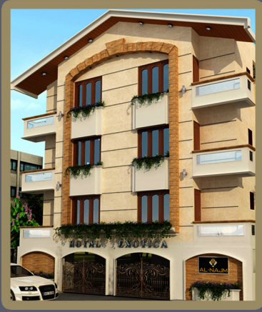
NAJM EXOTICA Robertson road