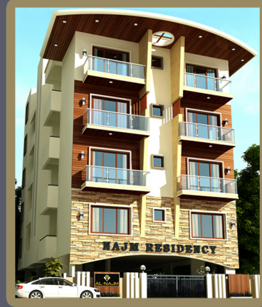
NAJM RESIDENCY Ratansingh road